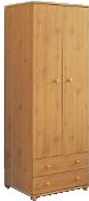
001 xx 6511