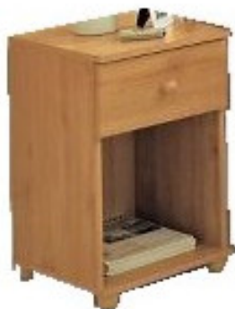
003 xx 6500