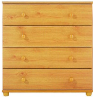
002 xx 6502