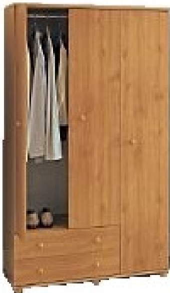
001 xx 6512