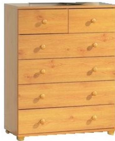
002 xx 6503