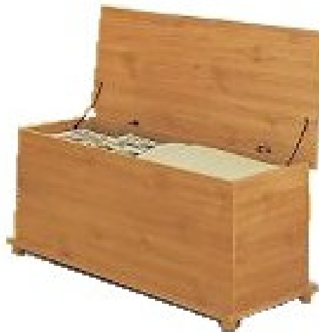
005 xx 6507